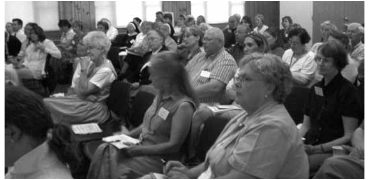
Educational Forum at Paul Smith's College