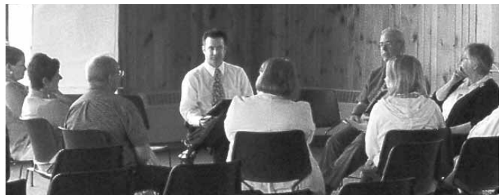
Small group discussion at Transformative Aging Educational Forum

Helpful tips were offered to assist those working with older adults as well as those seeking a way to grow older more gracefully. Following the presentation, small group discussions among participants were held to explore.