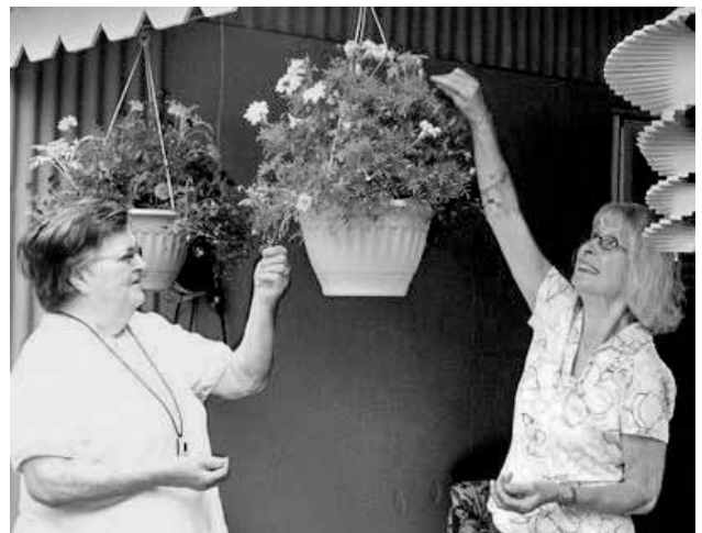
Mercy Care's services are offered in cooperation with churches and congregations of all faiths, and with families, community organizations, healthcare providers and agencies serving elders.