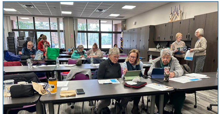
Technology Assistance – Creativity in Aging Workshop

Throughout 2025, Mercy Care hosted Technology Assistance Workshops for our Volunteers, Elders, and members of the community, at BOCES in Saranac Lake. These quarterly workshops are led by Mercy Care’s Director of Programs and Mission Integration, Project and Technology Manager, and Mercy Care Volunteer technology instructors. The Workshops are designed to assist those at the very basic level to a slightly more advanced intermediate level, with their phones, tablets, and iPads. The group instruction and one-on-one learning goals are to develop skills needed to use technology.