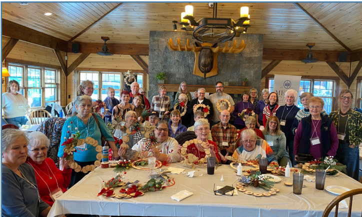
Holiday – Creativity in Aging Workshop

In November 2025, Mercy Care for the Adirondacks hosted their Friendship Volunteers, Elder Friends, and members of the community for a Holiday Connection with Community Event at Raquette River Brewing in Tupper Lake. Attendees made a beautiful wreath to take home and enjoy through the holidays.