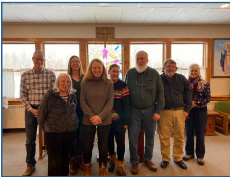
New Friendship Volunteers trained in Tupper Lake in January 2026