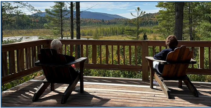
Reflection time at the 2025 Spirituality Retreat at Paul Smith's