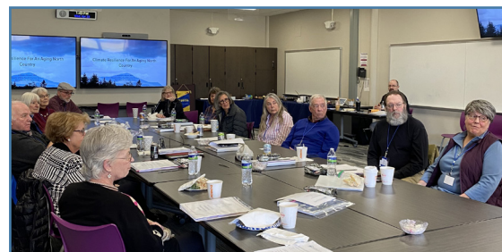
Disaster Preparedness In-service April 2025

From the daughter of a Mercy Care Elder Care Receiver: "Thank you for all that you do! My mother was so blessed by your caring dedicated volunteers."